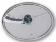
FCS / FCOS