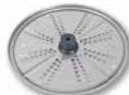
SHSF / SHSG